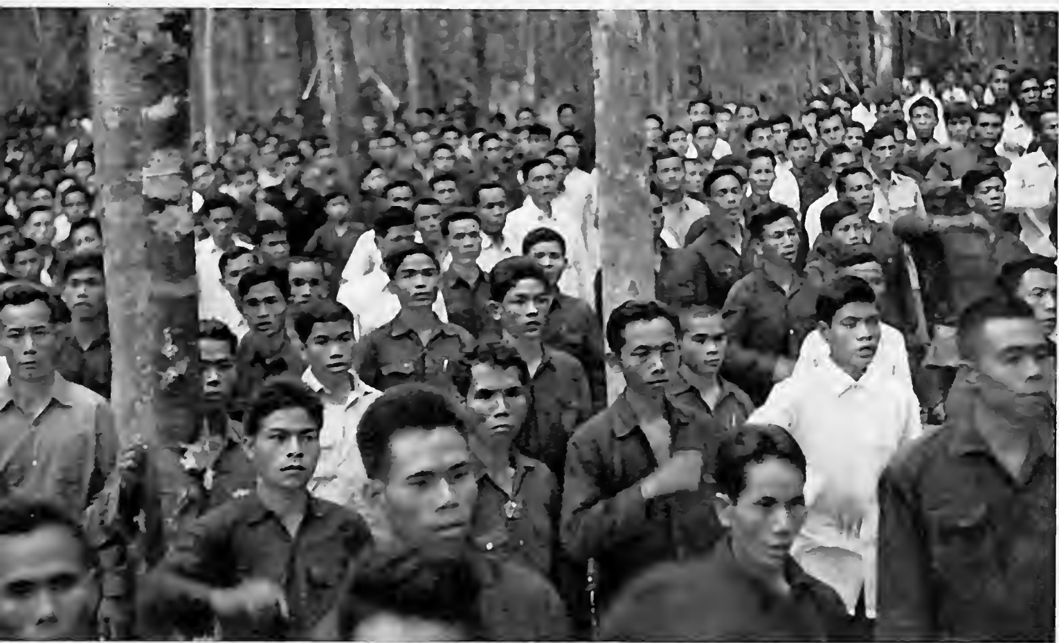
A battle-tempered people.